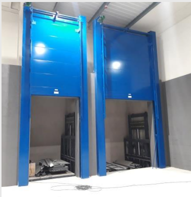
Fire Test EN 1634-1