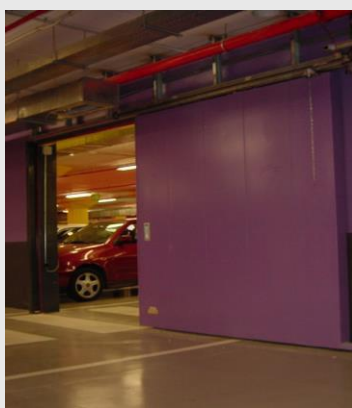
Fire Test EN 1634-1